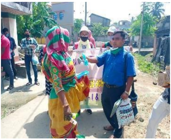
Principal OR. BNDS Mahavidyalaya Hatophindapur, Purba Bardhaman, 713407